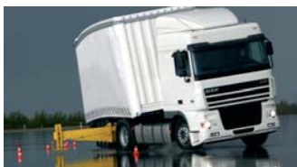
We are ready to carry out dynamic and static tests at your premises

Regardless whether the expert opinions concern long-distance heavy transport or are needed, in regard to an accident: you can place your trust in our independent expert knowledge.