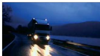
Your well-trained employees work more quickly and more efficiently