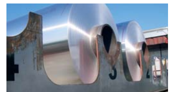
We offer individual solutions tailored to meet your needs