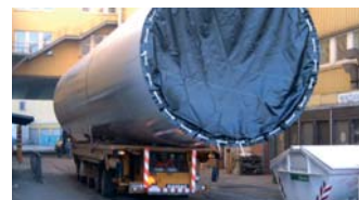
Our experts inspect your vehicles in connection with regard to the issuing of a certificate of exemption